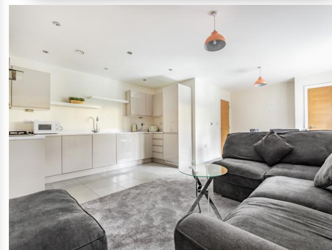
Flat 17 Lansdowne Place, Institute Road, Taplow, Maidenhead SL6 0FD