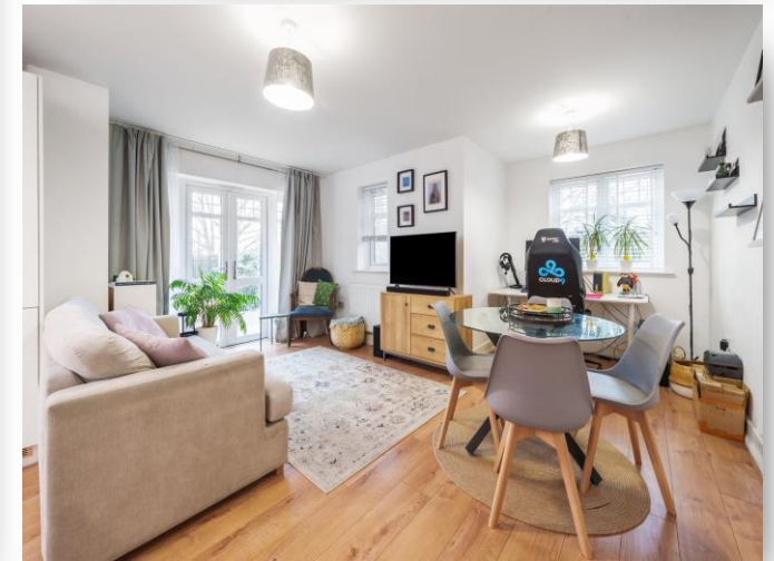
Flat 17 Hill View Court, 13 Bhamra Gardens, Maidenhead SL6 4FQ