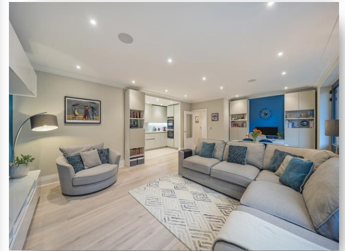
Flat 13 Jubilee Wharf, Glen Island, Taplow, Maidenhead SL6 0BN