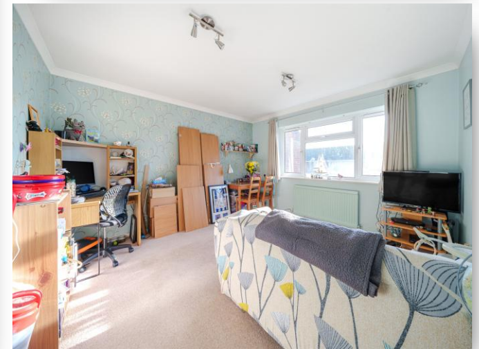
48 Foliejohn Way, Maidenhead SL6 3XB