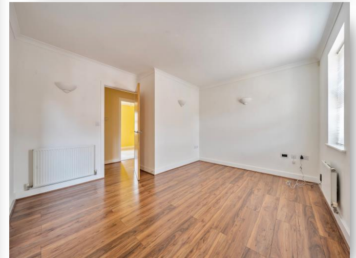
Flat 5 Ray Mill Place, North Dean, Maidenhead SL6 7GN