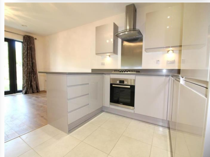
Flat 6 Lansdowne Place, Institute Road, Taplow, Maidenhead SL6 0FD