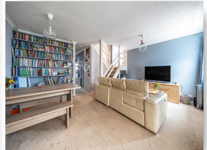
5 Merton Close, Maidenhead SL6 3HH