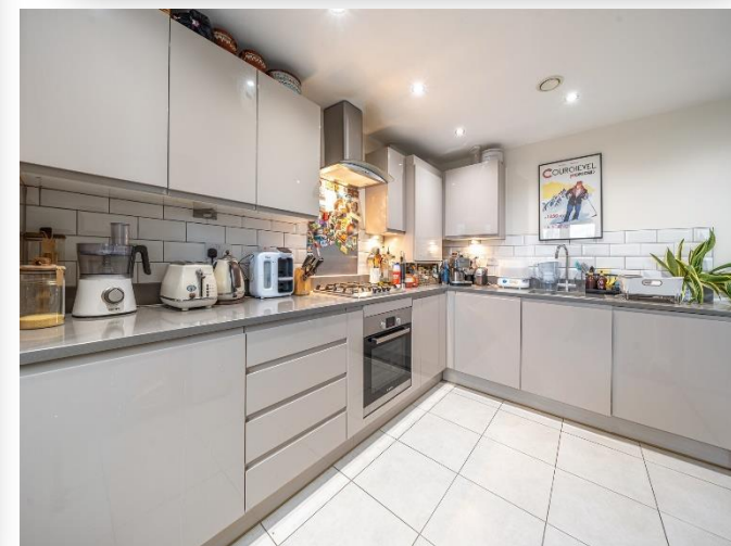
Flat 43 Lansdowne Place, Institute Road, Taplow, Maidenhead SL6 0FD