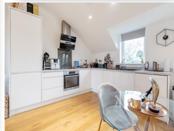
8 Somerset Lodge, Courtlands, Maidenhead SL6 2PT