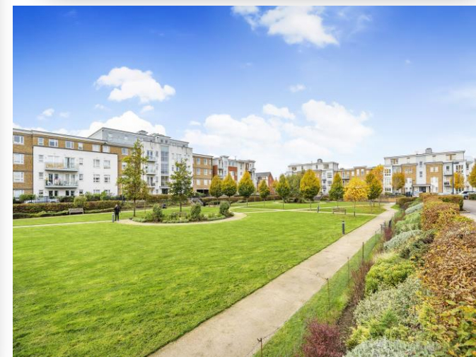
Flat 37 Heathland Court, 3 Grebe Way, Maidenhead SL6 8DE