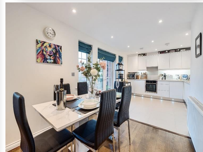
Apartment 6 Maiden Vale, 21 Craufurd Rise, Maidenhead SL6 7GQ