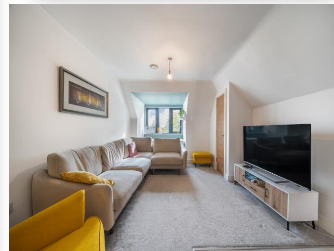
Flat 46 Lansdowne Place, Institute Road, Taplow, Maidenhead SL6 0FD