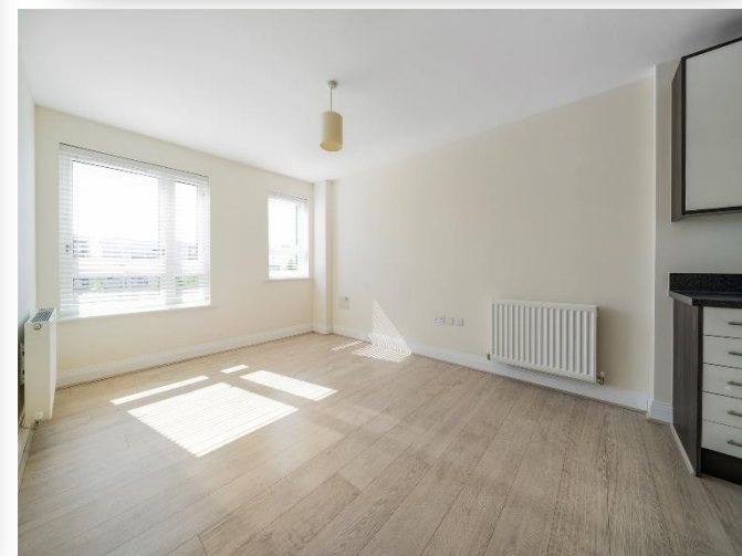
Flat 16 Heathland Court, 3 Grebe Way, Maidenhead SL6 8DE