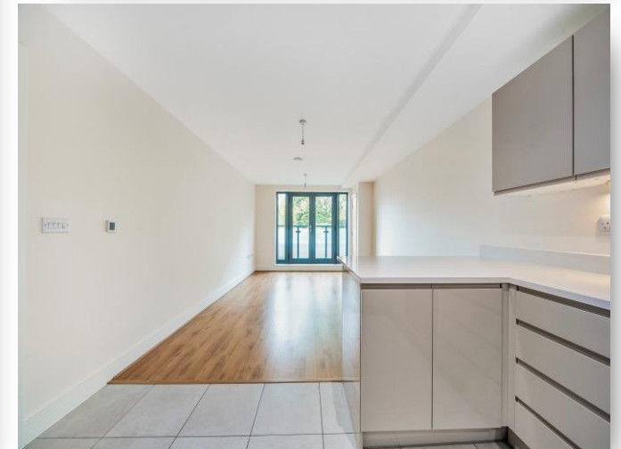
Flat 40 Lansdowne Place, Institute Road, Taplow Maidenhead SL6 0FD