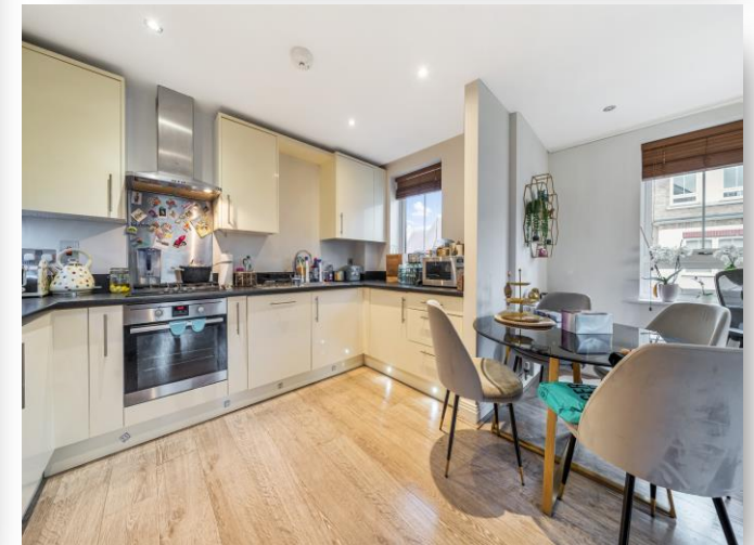
Flat 4 Ember Court, 2 Kingfisher Drive, Maidenhead SL6 8EL