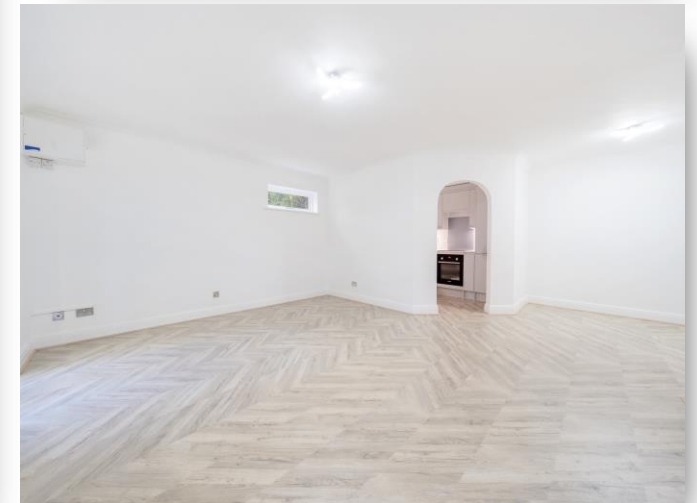
22 Lancaster Mews, Boyndon Road, Maidenhead SL6 4SA