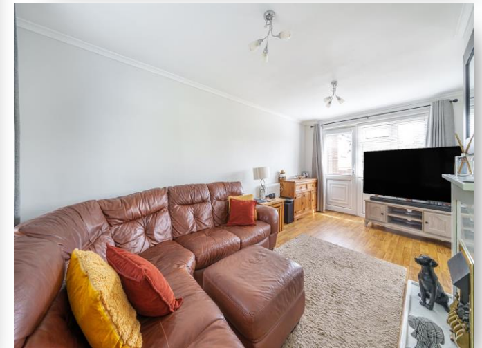
2 The Shaw, Cookham, Maidenhead SL6 9LX