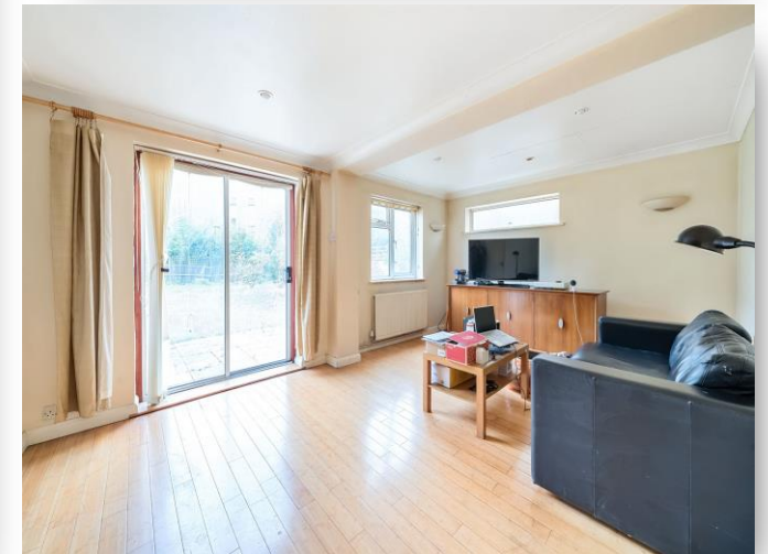
18 St. Lukes Road, Maidenhead SL6 7AN