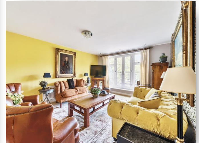
6 South Riding, Shoppenhangers Road, Maidenhead SL6 2GE