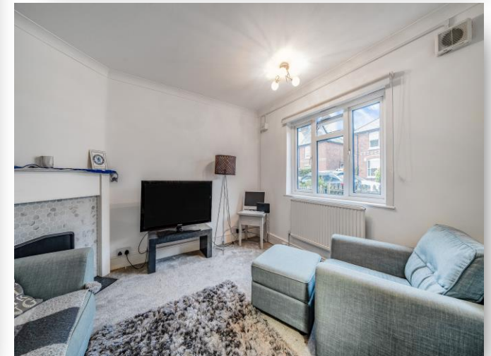
80 Powney Road, Maidenhead SL6 6EQ