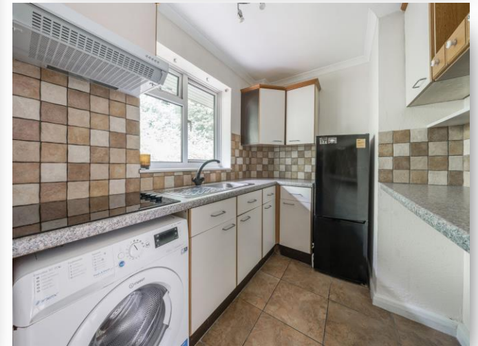
2 Henley Lodge, Courtlands, Maidenhead SL6 2PT