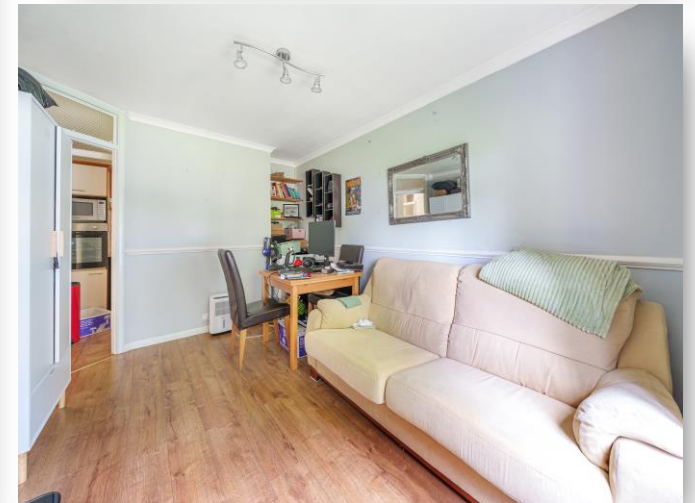
2 Henley Lodge, Courtlands, Maidenhead SL6 2PT