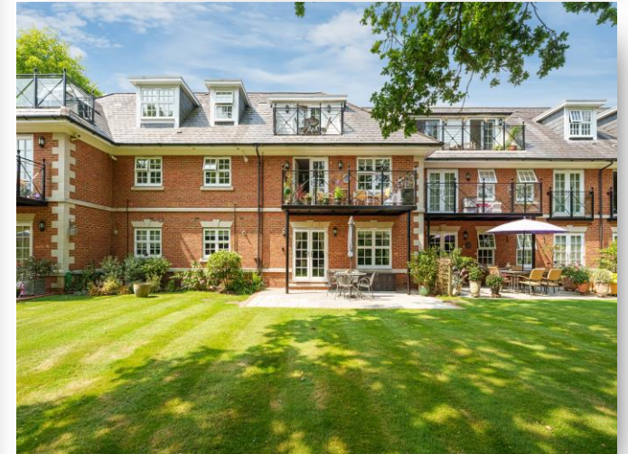
5 Robin Hill, Shoppenhangers Road, Maidenhead SL6 2GZ