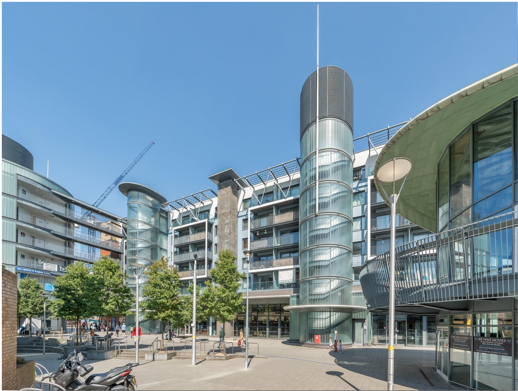
19 Providence House, Providence Place, Maidenhead SL6 8BF