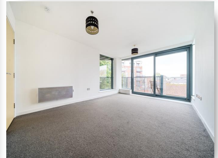
11 Providence House, Providence Place, Maidenhead SL6 8BF