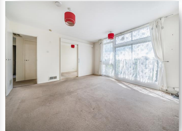
14 Dunwood Court, Boyn Valley Road, Maidenhead SL6 4JE