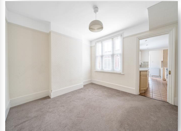
17 Camden Road, Maidenhead SL6 6HA