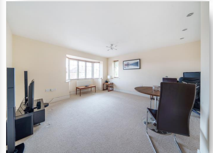
Flat 3 Alwyn Court, 78 Alwyn Road, Maidenhead SL6 5EL