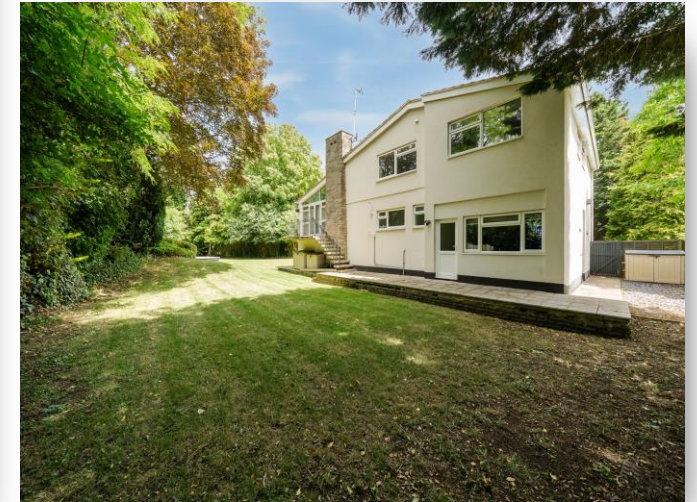
8 The Rushes, Maidenhead SL6 1UW