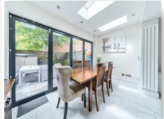
2 Guards Club Road, Maidenhead SL6 8DN