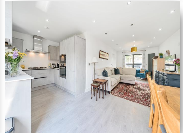
2 Poppies, 31a Heywood Court Close, Maidenhead SL6 3NB