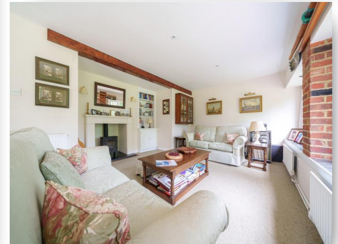
Apsley House, Thicket Grove, Maidenhead SL6 4LW