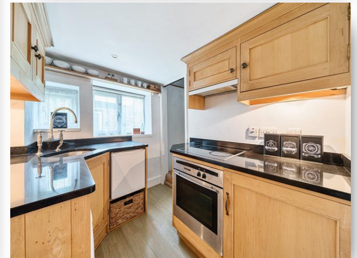
3 Wells Cottages, Cookham Dean Bottom, Cookham, Maidenhead SL6 9AP