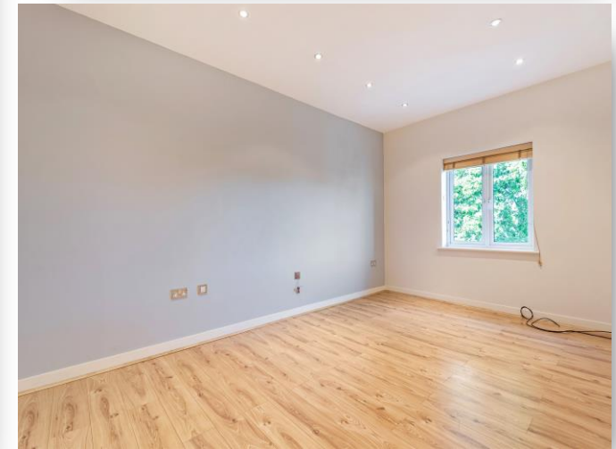
Flat 33 Park View, Grenfell Road, Maidenhead SL6 1FG