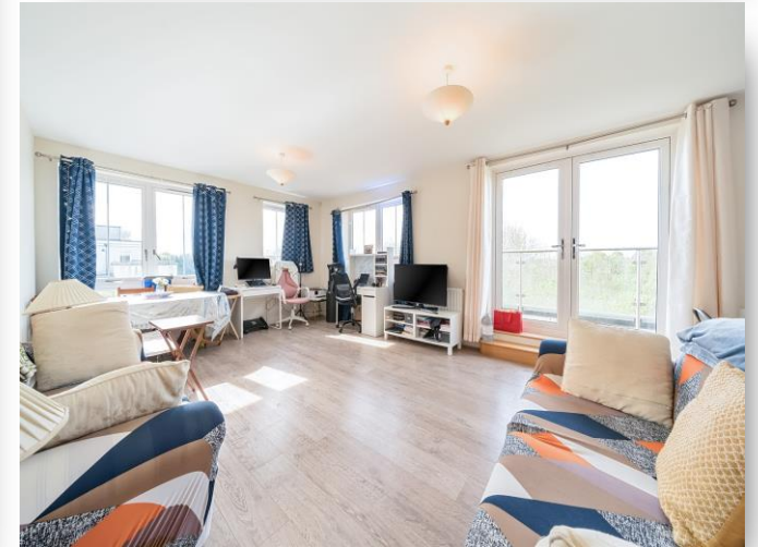
Flat 17 Swallowfield Court, 33 Kingfisher Drive, Maidenhead SL6 8FH