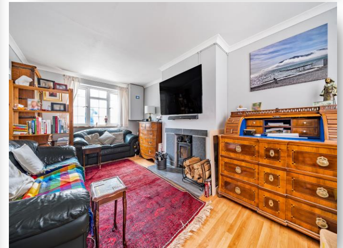
24 Shepherds Close, Hurley, Maidenhead SL6 5LY