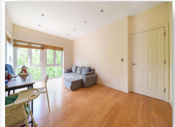
Flat 17 Park View, Grenfell Road, Maidenhead SL6 1FG