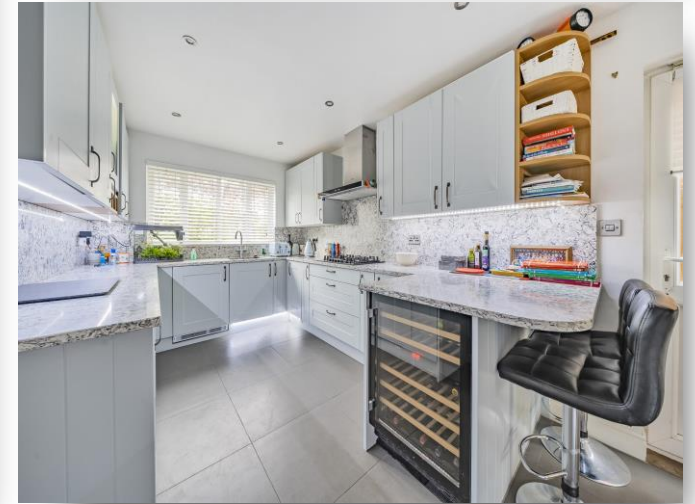
41 Raymond Road, Maidenhead SL6 6DF