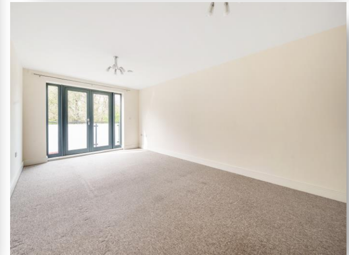
Flat 8 Lansdowne Place, Institute Road, Taplow, Maidenhead SL6 0FD