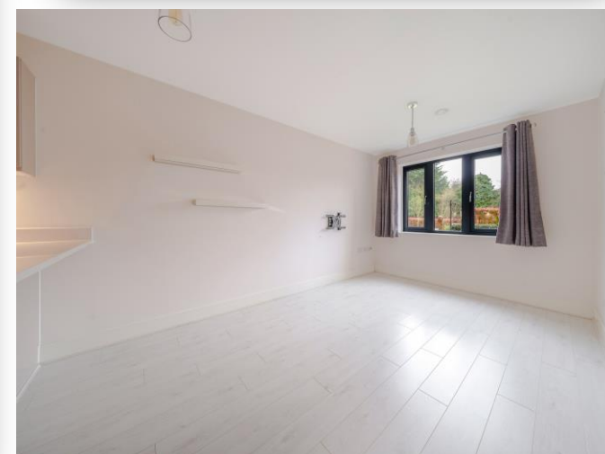
Flat 30 Lansdowne Place, Institute Road, Taplow, Maidenhead SL6 0FD