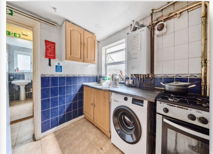
78 Grenfell Road, Maidenhead SL6 1HG