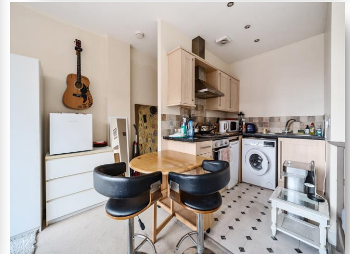
Flat 5 Butler House, 19-23 Market Street, Maidenhead SL6 8AA