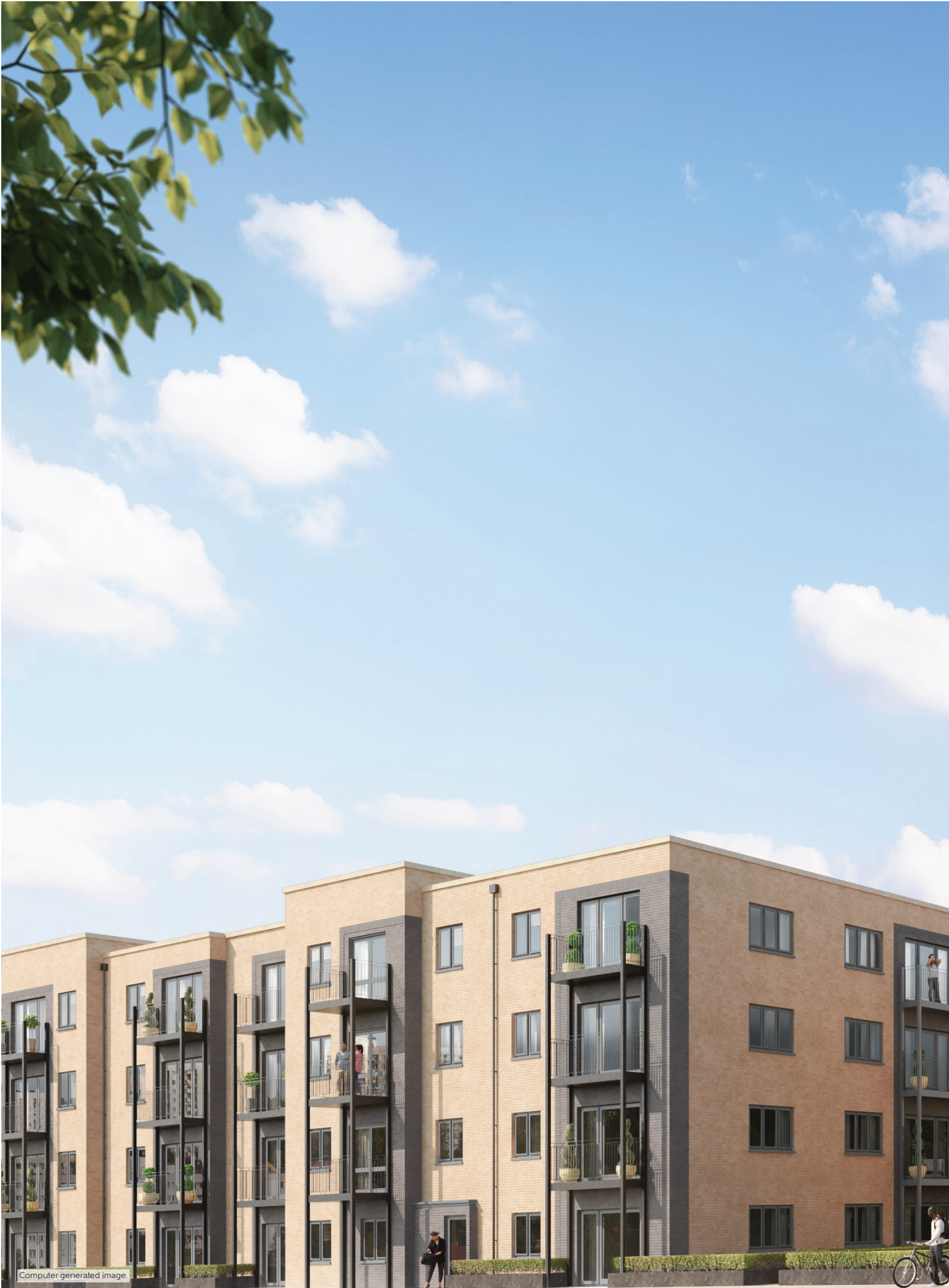
Computer generated image.