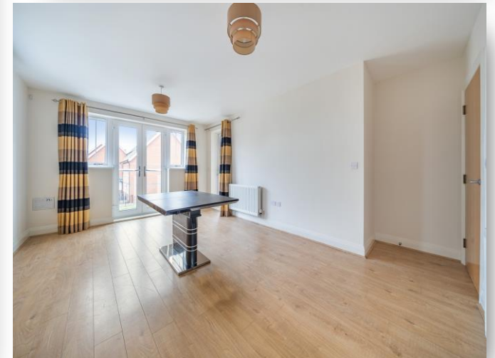
Flat 13 Swallowfield Court, 33 Kingfisher Drive, Maidenhead SL6 8FH