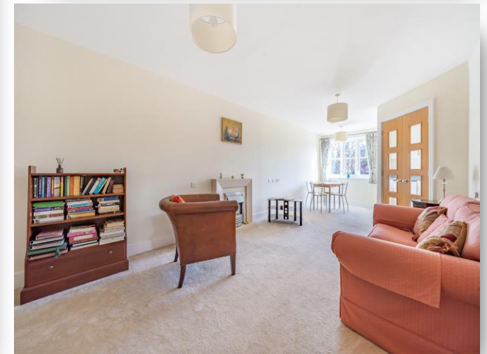
37 Swift House, 1 St. Lukes Road, Maidenhead SL6 7AJ