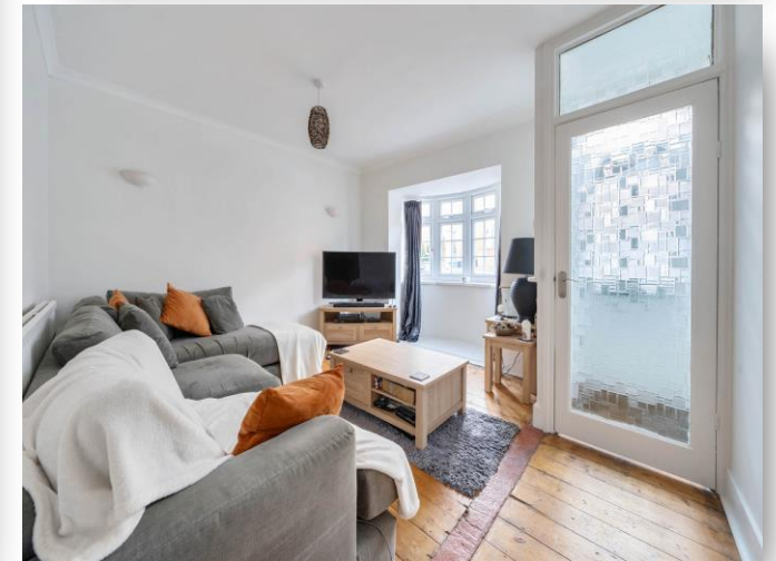
28 College Glen, Maidenhead SL6 6BL