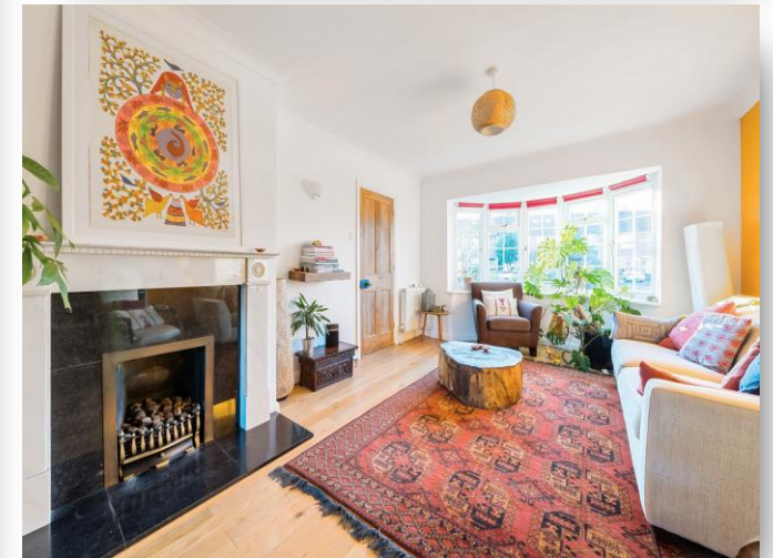
6 Blackamoor Lane, Maidenhead SL6 8RD