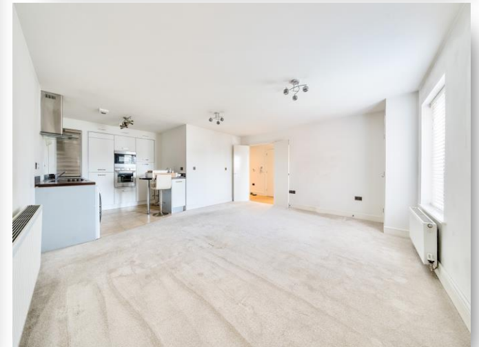
216 Burghley Court, Kingsquarter, Maidenhead SL6 1AW