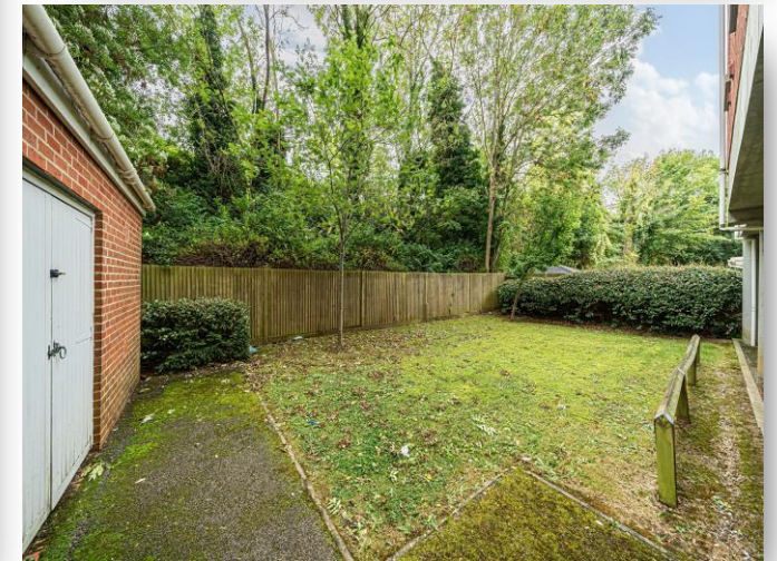
Flat 4 Delta Court, Grenfell Road, Maidenhead SL6 1ES