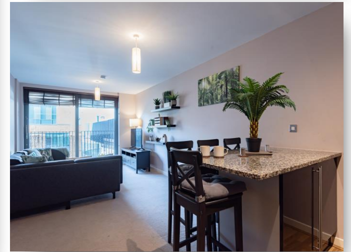
27 Providence House, Providence Place, Maidenhead SL6 8BF